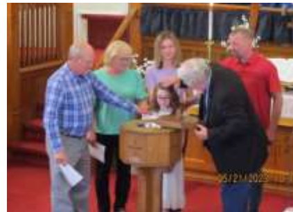
We welcome her into the family of God!!