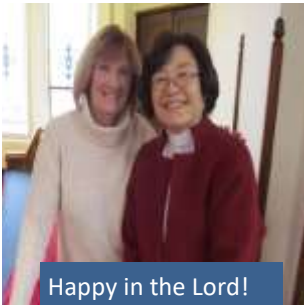
Happy in the Lord!

FUMC will be taking a Mission Trip to MMDC on June 26-30th! Next informational meeting is April 4th at 6:00PM