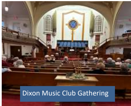
Dixon Music Club Gathering