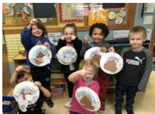
Lesson at Bright Beginnings Daycare this week: kids learn how Noah obeyed God.