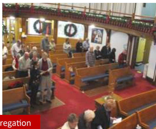
Faithful Congregation Singing Out!