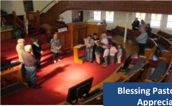
Blessing Pastors during Pastor Appreciation Month